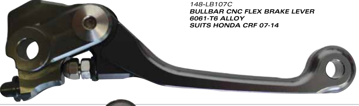
148-LB107C BULLBAR CNC FLEX BRAKE LEVER 6061-T6 ALLOY SUITS HONDA CRF 07-14