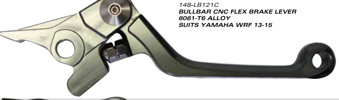
148-LB121C BULLBAR CNC FLEX BRAKE LEVER 6061-T6 ALLOY SUITS YAMAHA WRF 13-15