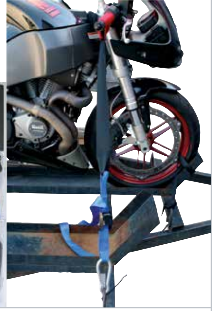
144-TDHAC HANDLEBAR HARNESS COMPLETE SYSTEM WITH SNAP HOOKS