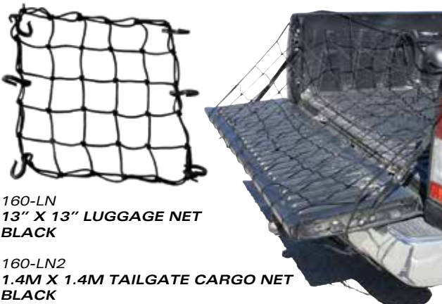
160-LN 13" X 13" LUGGAGE NET BLACK