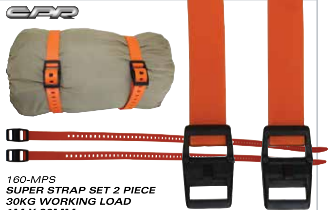
160-MPS SUPER STRAP SET 2 PIECE 30KG WORKING LOAD 1M X 20MM ADJUSTABLE, POLYURETHANE STRAP SAFER THAN BUNGEE CORDS. STRONG AND STRETCHY