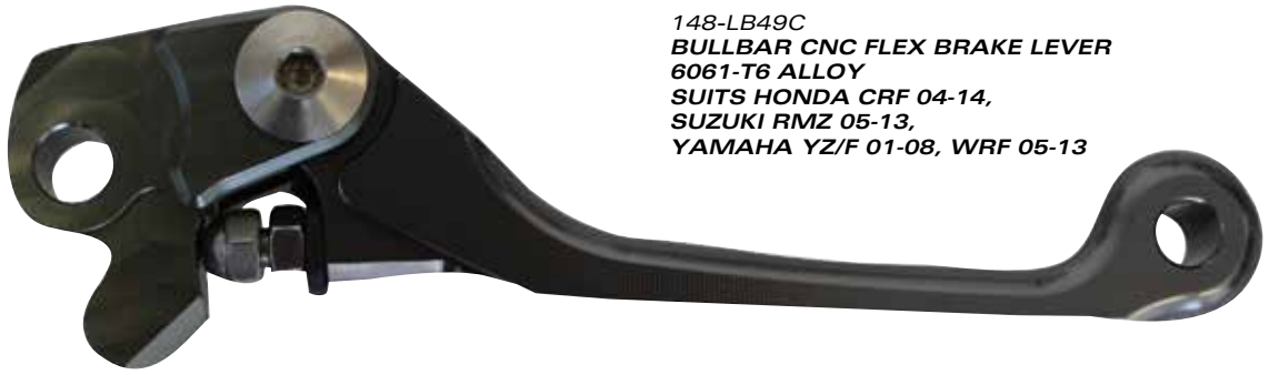
148-LB49C BULLBAR CNC FLEX BRAKE LEVER 6061-T6 ALLOY SUITS HONDA CRF 04-14, SUZUKI RMZ 05-13, YAMAHA YZ/F 01-08, WRF 05-13