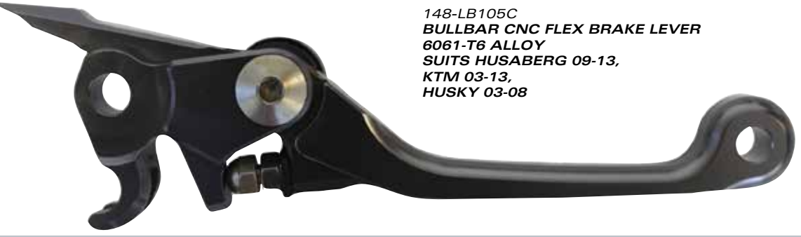
148-LB105C BULLBAR CNC FLEX BRAKE LEVER 6061-T6 ALLOY SUITS HUSABERG 09-13, KTM 03-13, HUSKY 03-08