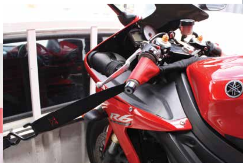
144-TDH HANDLEBAR HARNESS