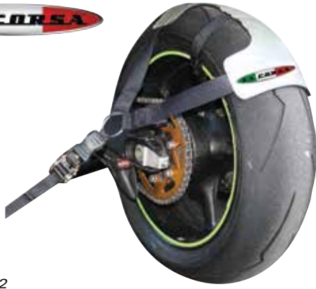
144-RWH2 REAR WHEEL HARNESS RATCHET SYSTEM STOPS TYRE BOUNCE WHILST IN TRANSIT MUST BE USED IN CONJUNCTION WITH TIE DOWNS FOR FRONT & REAR WHEELS