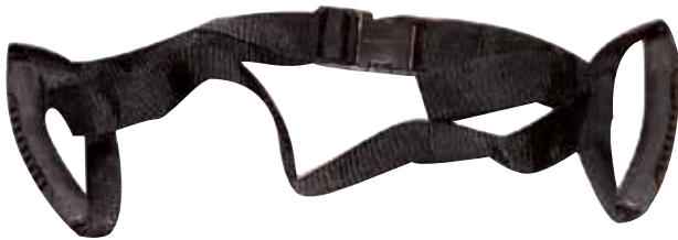
160-PP PILLION PAL RIDERS BELT WITH PASSENGER HANDLES GREAT FOR KIDS BLACK