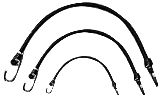
162-OST18/24/36 18, 24 OR 36 INCH OCKY STRAP HEAVY DUTY SOLD IN BAGS OF 10