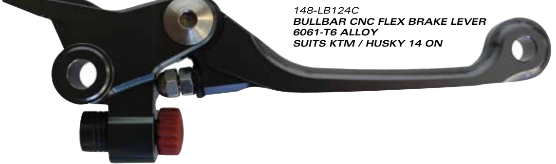
148-LB124C BULLBAR CNC FLEX BRAKE LEVER 6061-T6 ALLOY SUITS KTM / HUSKY 14 ON