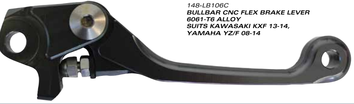
148-LB106C BULLBAR CNC FLEX BRAKE LEVER 6061-T6 ALLOY SUITS KAWASAKI KXF 13-14, YAMAHA YZ/F 08-14