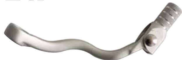
128-GL53F GEAR LEVER KTM SX250 FORGED ALLOY