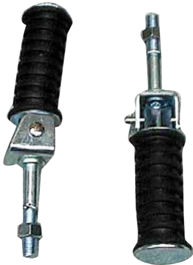
119-FP10L FOOTPEGS 10MM UNIVERSAL LONG SUITS HONDA, KAWASAKI & SUZUKI