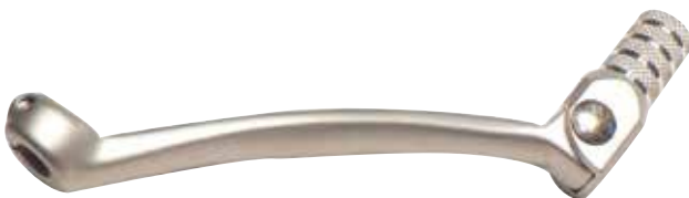
128-GL46F GEAR LEVER YAMAHA WR250/450 07-08, YZ250F 06-08 FORGED ALLOY