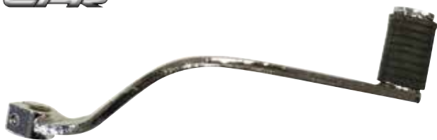
128-GL24 GEAR LEVER KAWASAKI ATC185/200 TRX300 STEEL