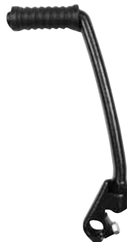
146-KDT YAMAHA KICKSTARTER DT125/175, IT175 17MM SPLINE