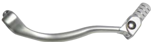
128-GL48F GEAR LEVER KAWASAKI KX450F 06-07 FORGED ALLOY