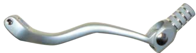
128-GL33F GEAR LEVER HONDA CR250 04-06 FORGED ALLOY