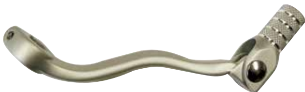
128-GL35F GEAR LEVER HONDA CRF250 04 FORGED ALLOY