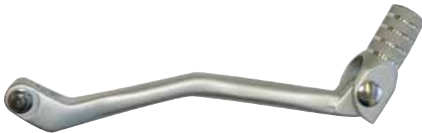
128-GL44F GEAR LEVER GAS GAS ALL ENDURO 2 & 4 STROKE 98-06 FORGED ALLOY