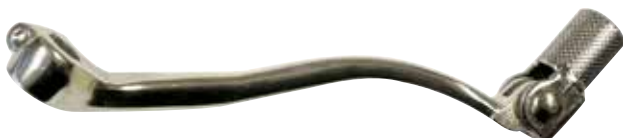
128-GL25F GEAR LEVER KAWASAKI KXF250 04-06 SUZUKI RMZ250 04 FORGED ALLOY