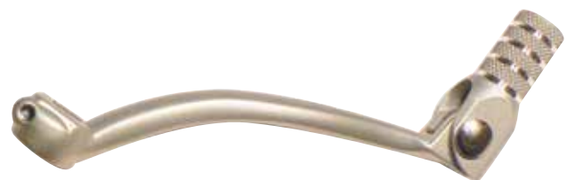
128-GL47F GEAR LEVER YAMAHA YZ450F 06-08 FORGED ALLOY