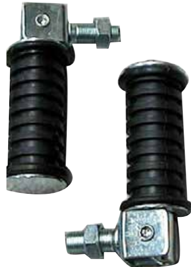
119-FP12U FOOTPEGS 12MM UNIVERSAL SUITS YAMAHA