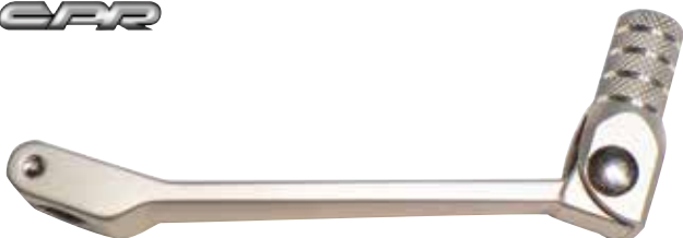
128-GL50F GEAR LEVER HONDA CRF150F/230F 03-07 FORGED ALLOY