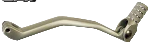
128-GL26F FORGED ALLOY GEAR LEVER YAMAHA YZ/WR250F 99-04, YZ/WR450 05-06