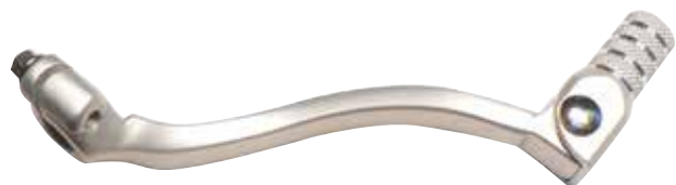
128-GL51F GEAR LEVER SUZUKI RMZ250 07-08 FORGED ALLOY