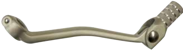
128-GL39F GEAR LEVER KAWASAKI KXF450 04-06 FORGED ALLOY