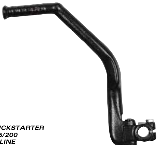
146-KXL HONDA KICKSTARTER XL125/185/200 16MM SPLINE