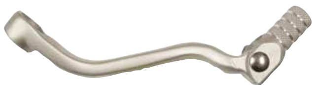
128-GL23F GEAR LEVER KTM 4 STROKE 01-03 FORGED ALLOY