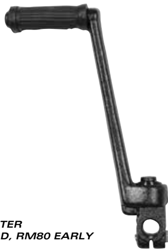
146-KDS SUZUKI KICKSTARTER DS80, EARLY ROAD, RM80 EARLY 13MM SPLINE