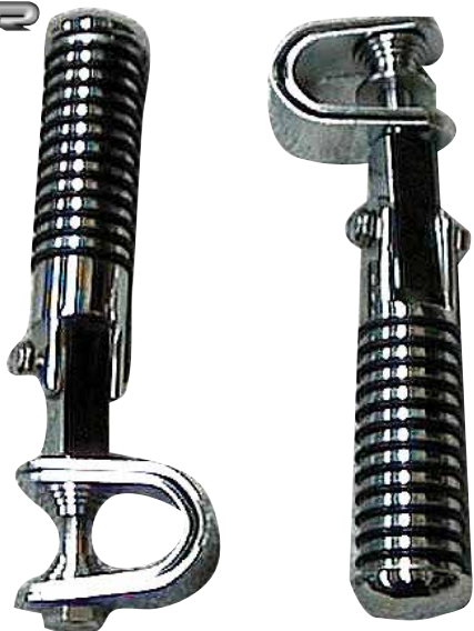
119-FPO FOOTPEGS O'RING CHROME CLAMP ON