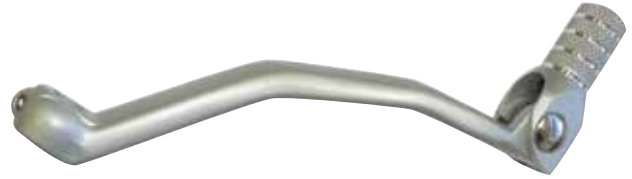
128-GL43F GEAR LEVER YAMAHA YZ125 05-06 FORGED ALLOY