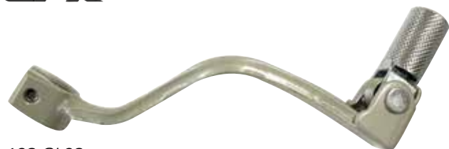
128-GL28 GEAR LEVER KAWASAKI KX60/80 83-85, KX125/250/500 84-86, KDX250 YAMAHA YZ80 H,J,K 81-83, YZ85 ALL 11MM SPLINE STEEL