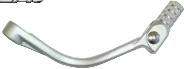
128-GL37F GEAR LEVER KTM SX85 FORGED ALLOY