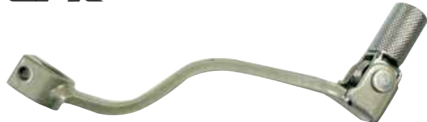
128-GL29 GEAR LEVER KAWASAKI KX65 ALL STEEL