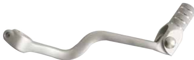
128-GL52F GEAR LEVER HUSQVARNA 250/450 FORGED ALLOY