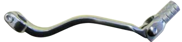
128-GL45F GEAR LEVER SUZUKI DRZ400 04-05 FORGED ALLOY