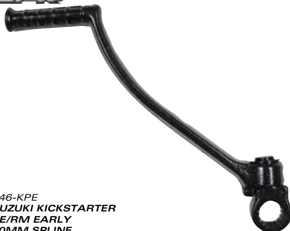
146-KPE SUZUKI KICKSTARTER PE/RM EARLY 20MM SPLINE