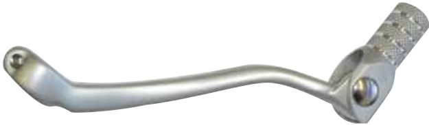
128-GL42F GEAR LEVER SUZUKI RMZ450 FORGED ALLOY