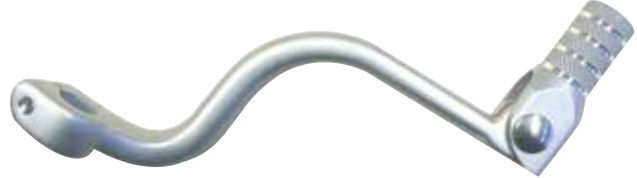
128-GL40F GEAR LEVER KAWASAKI KX250 05-06 FORGED ALLOY