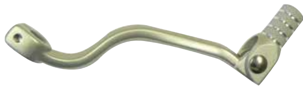
128-GL49F GEAR LEVER KAWASAKI KX65 00-07 FORGED ALLOY