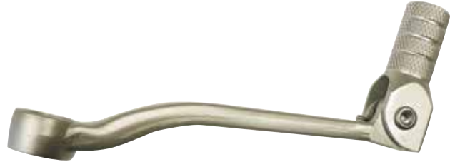
128-GL38F GEAR LEVER KTM LC4 400/620/625/640 88 ON FORGED ALLOY