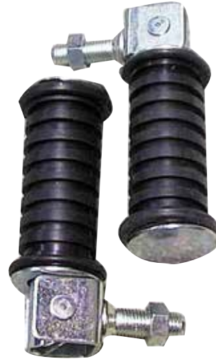
119-FP10U FOOTPEGS 10MM UNIVERSAL SUITS HONDA, KAWASAKI & SUZUKI