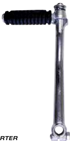
146-KYZ YAMAHA/HONDA KICKSTARTER YZ80 EARLY, SL70