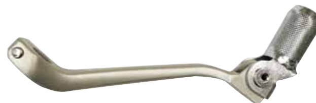
128-GL36F GEAR LEVER HONDA CRF450 FORGED ALLOY