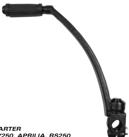
146-KTS SUZUKI KICKSTARTER TS125/185, RGV250, APRILIA, RS250 16MM SPLINE